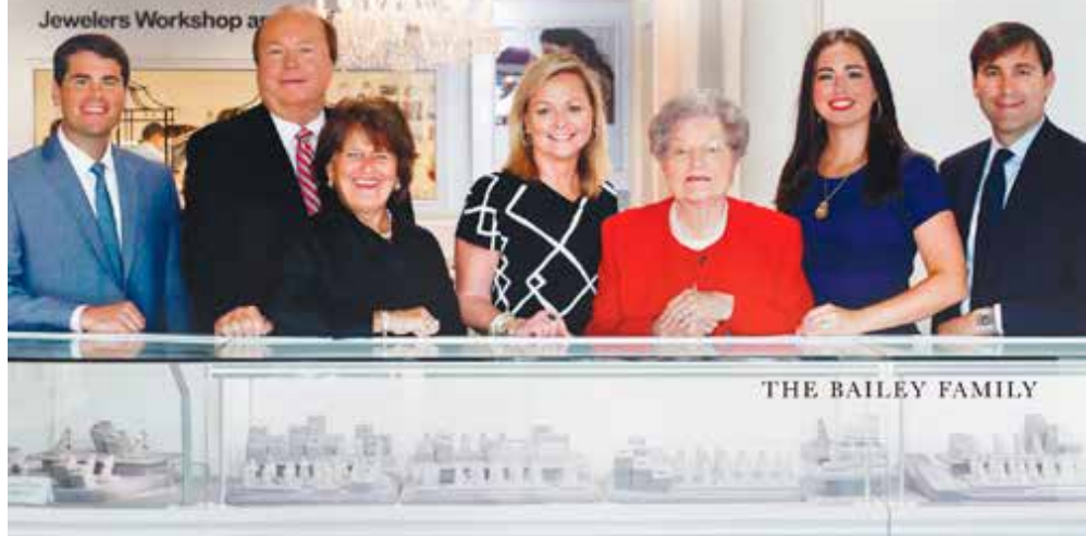
THE BAILEY FAMILY